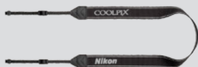
AN-CP21 Camera Strap